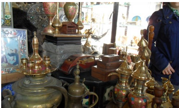
ainudil (image cropped)

Baghdad's historic shopping area stretches out from Shuhada Bridge to Ahrar Bridge, Rashid Street being a traveler's main landmark - most specialized shopping streets (souqs) are off the Rashid Street's either side. Some highlights of the busy shopping labyrinth include the deafening Coppersmith Souq, vibrant Shorjah