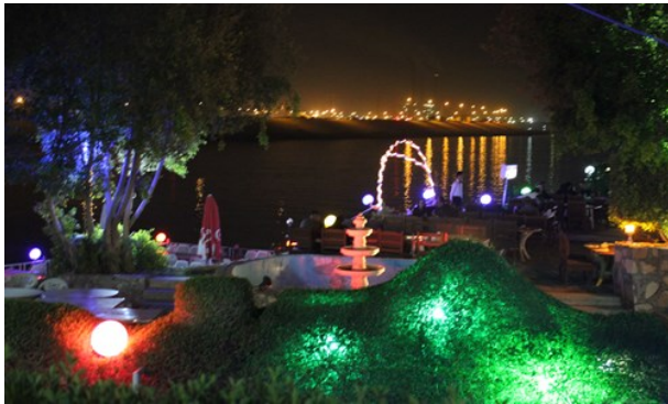
ainudil (image cropped)

After years of violence and imposed curfews, Baghdad's once famous nightlife is slowly coming back to life. Throngs of young residents can be seen enjoying themselves at outdoor cafes and pool halls, drinking beer and playing dominoes until as late as midnight. Bars and restaurants and even a nightclub or two are once again filling the city's nights with merriment, but for foreign visitors, the best place to get a drink and enjoy the night is still at one of the international organisations or private clubs.